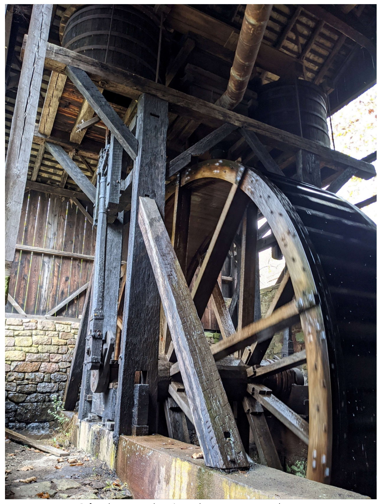
Before there was rocket science, there was water power!